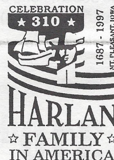
Harlan 310 Reunion Logo